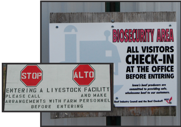
Make sure you have permission to enter this operation. Follow all posted signs and protocols.