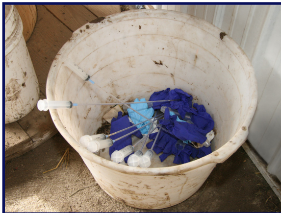
Leave trash generated on the operation behind.