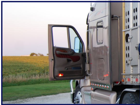
Ensure equipment, clothing and footwear are not soiled before entering vehicle to avoid cross-contamination between operations.