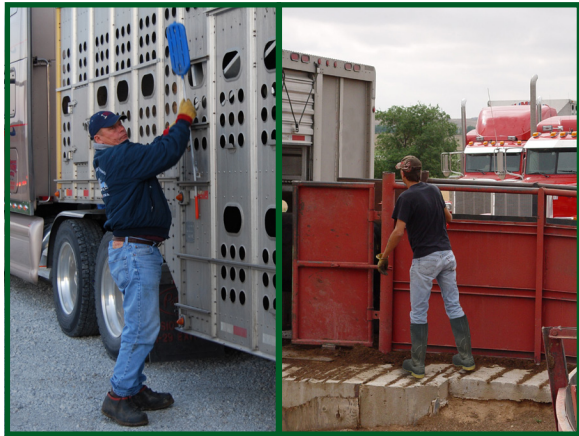
Wear clean work clothing that has not been around animals on other operations. Limit cattle contact to essential tasks.