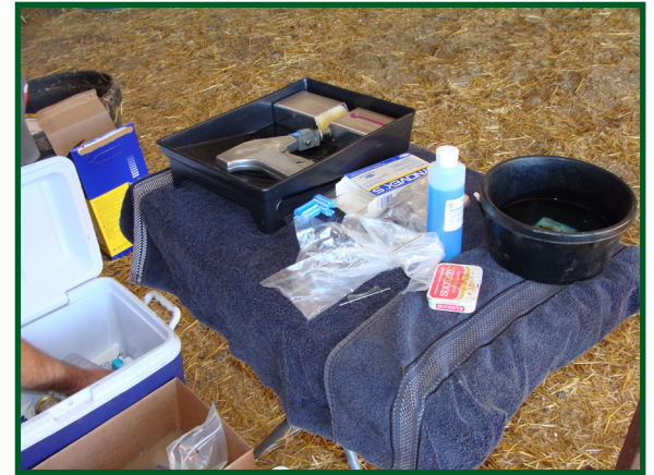
Clean equipment and supplies between different animal groups and operations to avoid cross-contamination.