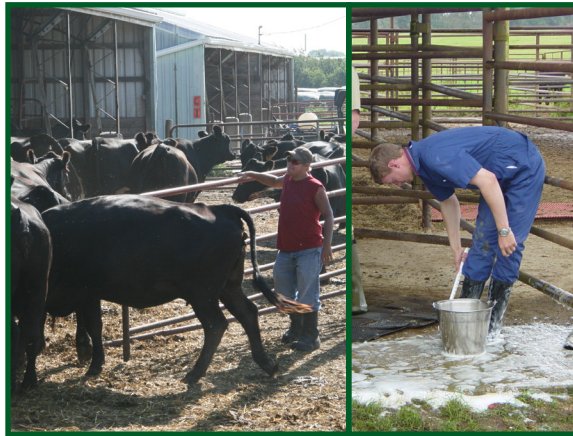
Wear footwear that can be cleaned (manure removed) when moving between different animal groups and before leaving.