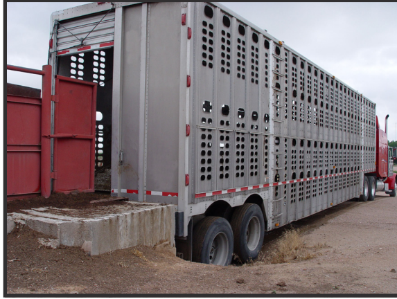
Respect the Line of Separation (LOS) between off-site and on-site traffic. Drive and park in designated areas. Follow required biosecurity protocols when crossing the LOS.