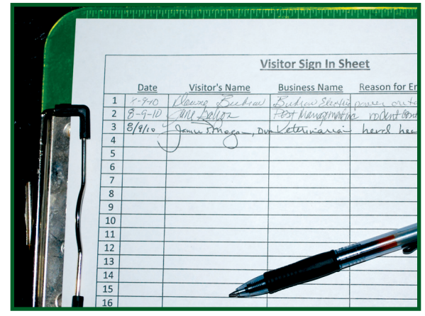
Be prepared to sign a visitor's log, if available.