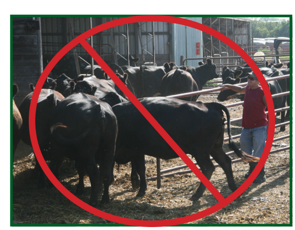
Avoid direct contact with cattle, cattle feed, manure, and other excretions. If cattle contact becomes necessary, follow required biosecurity protocols to avoid introducing or spreading disease.