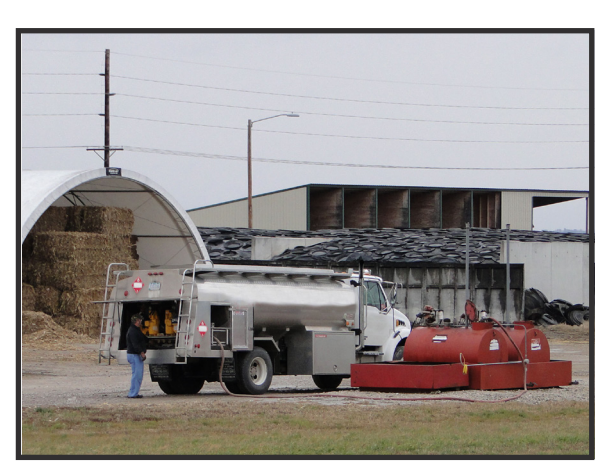
Drive and park in designated areas. Follow all posted signs.