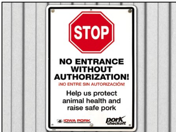
Prior to arrival, obtain permission to enter the site. Follow any farm downtime requirements.

Prior to farm visit, review biosecurity protocols with farm personnel. Below are general guidelines for farm biosecurity.