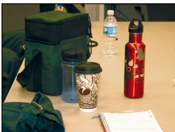
Do not eat or drink in animal areas. Keep food in a breakroom or office.