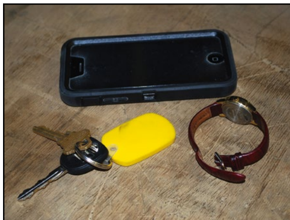
Do not bring personal items into the farm without approval.