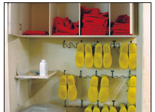
Wear site-specific clean coveralls or clothing and footwear to limit the spread of disease between sites.