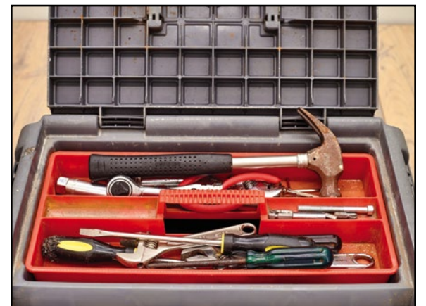
Follow biosecurity measures for supply entry which may include cleaning and disinfecting.