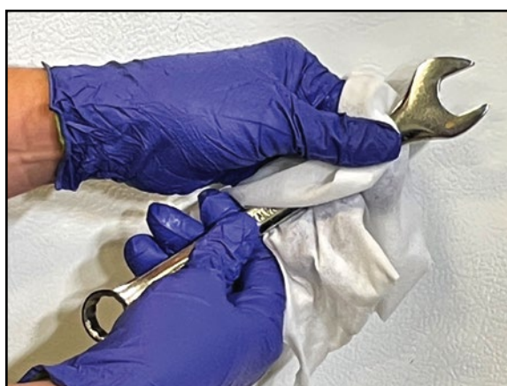
Always follow the farm's biosecurity protocols including cleaning and disinfecting equipment prior to leaving the farm.