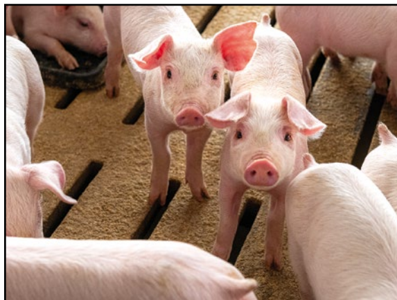
Inform farm personnel when you were last in contact with pigs or locations with pigs.