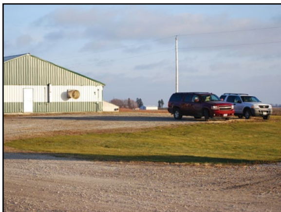
Arrive with a clean vehicle and park in the designated area or away from animal barns.