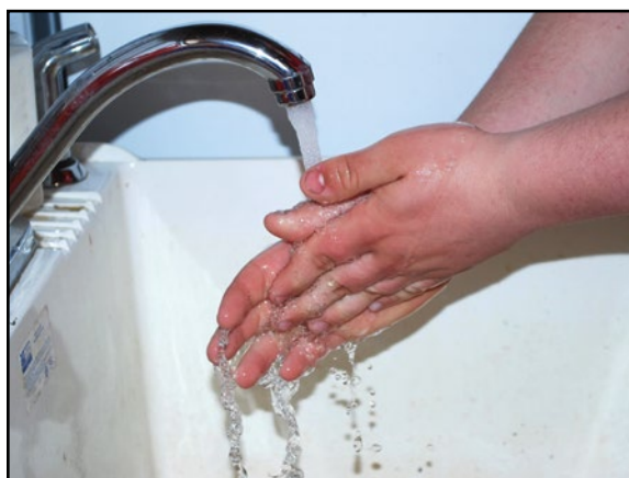
Wash hands before and after entry or during shower-in/shower-out. Follow all farm entry policies and respect the line of separation.