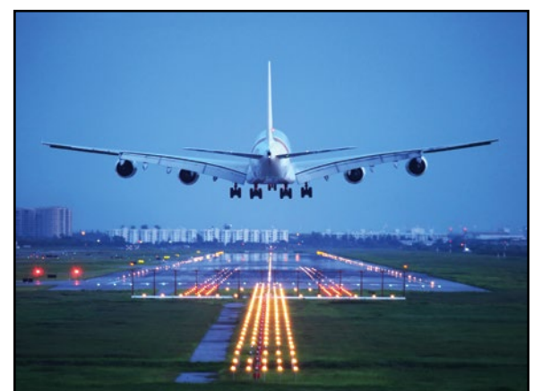
Follow the farm downtime policy after international travel. A period of downtime or extra biosecurity measures may be needed.