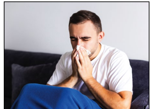
Do not enter the site if you are sick.