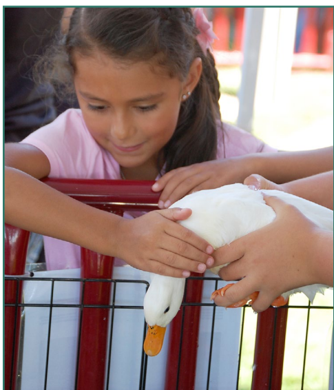
Girl petting a duck.

Agritourism can provide exciting attractions, public education, and added income to farms and ranches. Animals can be a fun part of the tour. Keeping your animals and visitors healthy can happen with some simple biosecurity actions.