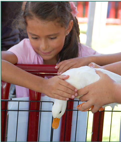
Girl petting a duck.

Agritourism can provide exciting attractions, public education, and added income to farms and ranches. Animals can be a fun part of the tour. Keeping your animals and visitors healthy can happen with some simple biosecurity actions.