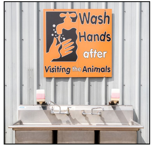
A handwash station with appropriate signage for visitors.