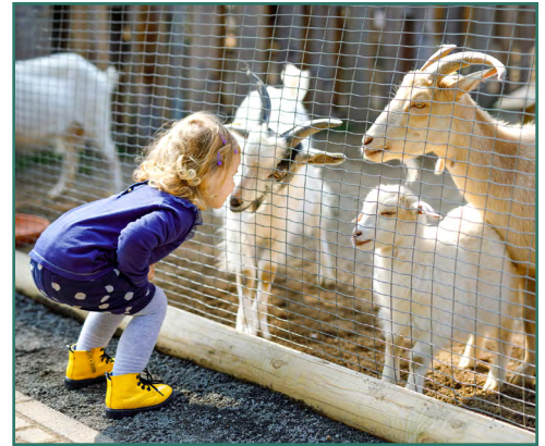
Girl interacting with goats behind a fence.