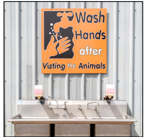
A handwash station with appropriate signage for visitors.