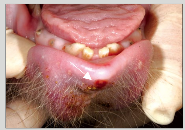
Erosion of tip of lower lip