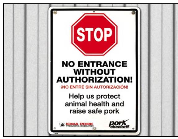
Prior to arrival, obtain permission to enter the site. Follow any farm downtime requirements.

Prior to farm visit, review biosecurity protocols with farm personnel. Below are general guidelines for farm biosecurity.