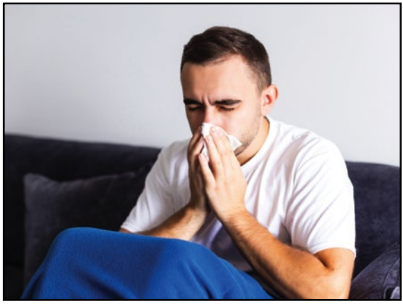
Do not enter the site if you are sick.