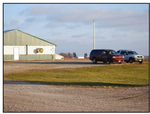
Arrive with a clean vehicle and park in the designated area or away from animal barns.