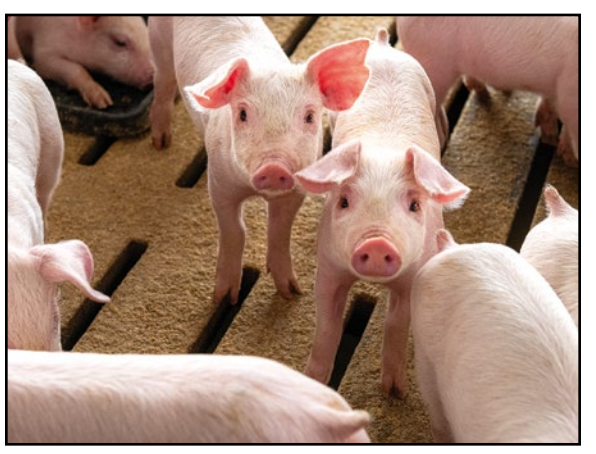
Inform farm personnel when you were last in contact with pigs or locations with pigs.