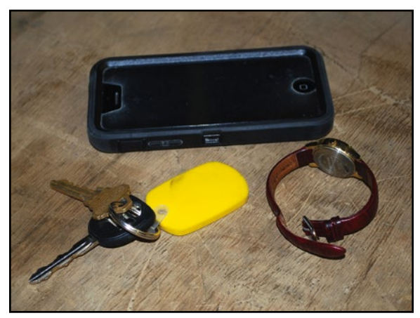
Do not bring personal items into the farm without approval.