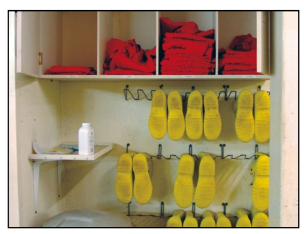
Wear site-specific clean coveralls or clothing and footwear to limit the spread of disease