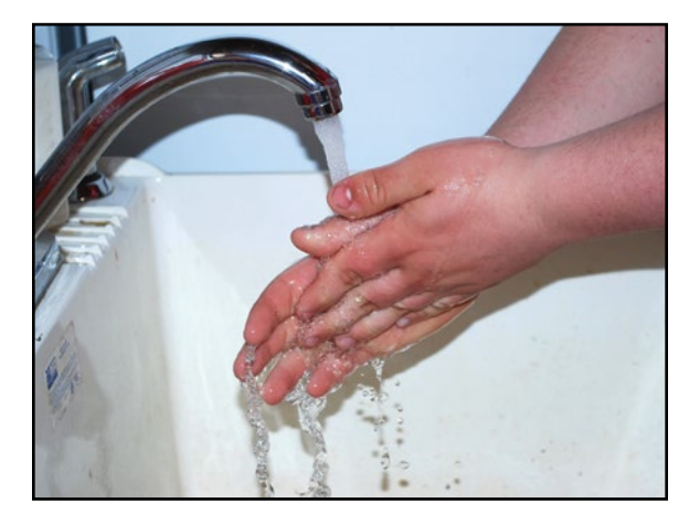
Wash hands before and after entry or during shower-in/shower-out. Follow all farm entry