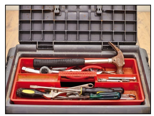
Follow biosecurity measures for supply entry which may include cleaning and disinfecting.