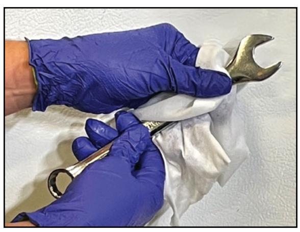
Always follow the farm's biosecurity protocols including cleaning and disinfecting equipment prior to leaving the farm.