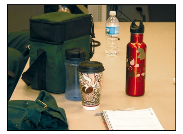
Do not eat or drink in animal areas. Keep food in a breakroom or office.