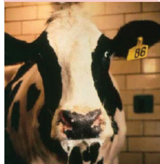
Excessive drooling following blistering and lesions in the mouth