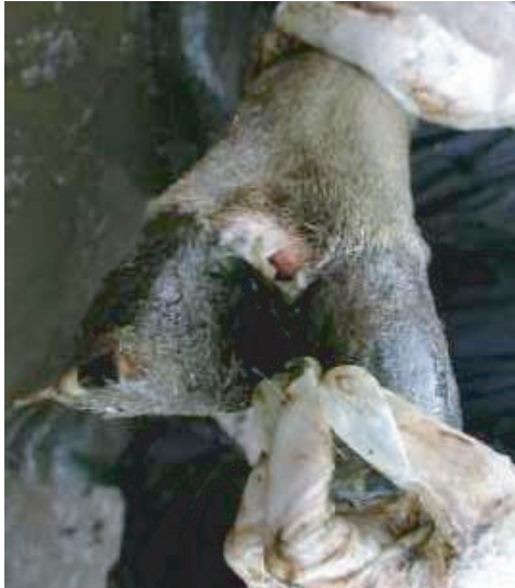
Ulcer between the toes